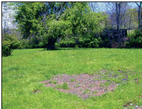
Discolored or dead vegetation can indicate a pipeline leak.

Your call will go directly to the EGTS Gas Control Center, a facility manned 24 hours a day, every day of the year. A Eastern Gas Transmission & Storage team will be dispatched immediately to investigate any reported leaks.