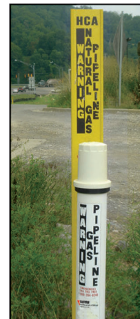
5. HCA marker and cathodic protection test station