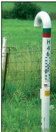
1. Vent Pipe