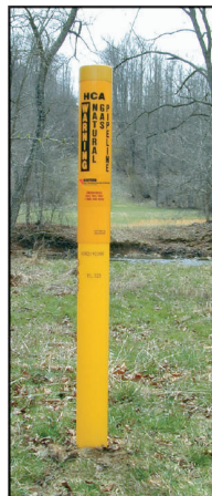
3. High-consequence area entrance or exit marker (arrow on top)