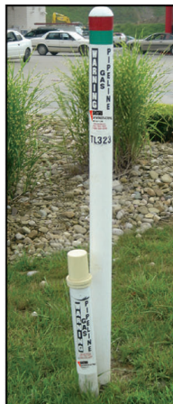
2. Linemarker and cathodic protection test station