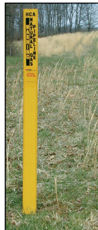
4. HCA line-of-sight marker